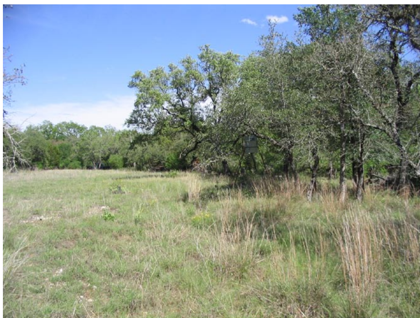
Figure 6. Southeast quadrant in March 1999 (top) and April 2006 (bottom). The structure is a defunct deer feeder. One day this will be converted into a bird feeder. The top photo is about 2 years after the cedar was sheared and before the area was burned; the bottom photo is some 7 years later revealing improved health of oak trees and established grass cover.

plants were found in this plot). After about a year, there has been no germination of those seeds and most of this area has been reinvaded by KR bluestem. The Wildflower Center has also experimented with summer burning, which has been reported to be successful (Ewing et al. 2005). Controlled burning at our site is not feasible at this time because of climatic conditions and the requirements of manpower and equipment.