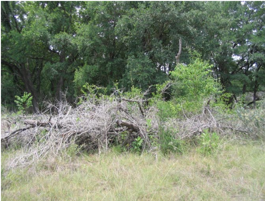
Figure 2. Soapberry ( Sapindus sp.) growing within a pile of sheared cedar ( Juniperus ashei ) as a result of protection from browsing by white-tailed deer ( Odocoileus virginiana ), 2006.

the clearing process, then growth could regenerate from these, but there were a number of areas where no small plants were evident and regrowth must have resulted from the germination of seeds already in the soil. Several small cedars we extracted displayed singular roots 4 to 10 times the length of the above-ground growth. In a few areas, we have removed this secondary growth every year for most of the ten-year span of this restoration. During this time, the grass has become very thick and high, and yet new cedar growth occurs each year.