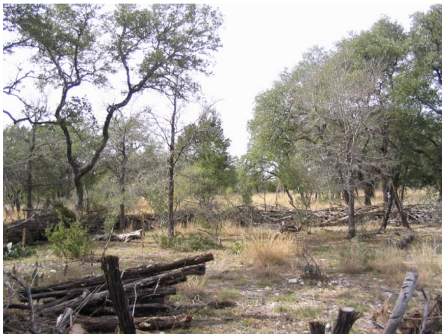
Figure 3. A large pile of sheared cedar arranged to exclude deer browsing, 2006.

Between 2003 and 2005 we used sheared and chainsaw-cut cedar to construct deer exclosures; the first around a 120-m 2 area, and the second around a 520-m 2 area (Figure 3, see online appendix for planted species). Both these exclosures are located in the southeast quadrant within 60 m of the