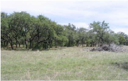
Figure 4. Savanna in the northwest quadrant of the property in June 1996 (top) and April 2006 (bottom).

hunting will be necessary. Hunting pressure has had a very positive effect on the level of browsing, which has noticeably diminished in most areas. Browse monitoring began about 2000, and is used in lieu of making an annual deer census, which is time consuming and results in only an approximate measurement.