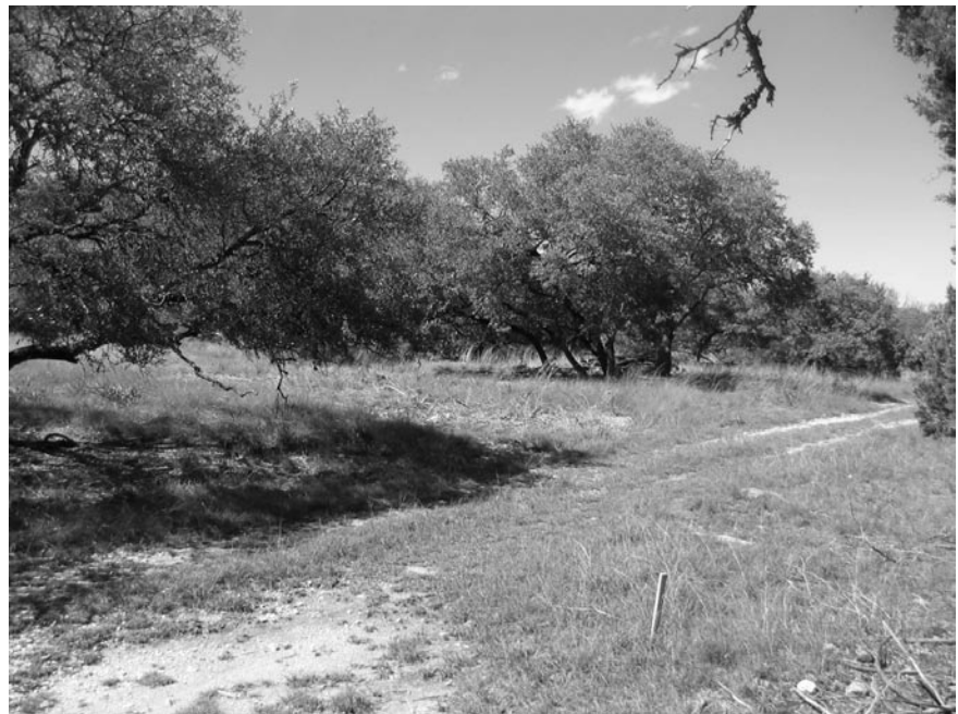
Figure 5. Savanna in the southeast quadrant in November 2002 (top) and April 2006 (bottom).

commercial herbicide and plant the seeds of the fast-growing and tall grasses blue grama ( Bouteloua gracilis ), green sprangletop ( Leptochloa dubia ), little bluestem, and Indian-grass ( Sorghastrum nutans ) that will eventually shade out the KR. We treated two plots this way using seed purchased from a native seed company about 160 km away. In one plot, about 25% of the KR was not killed by herbiciding and almost none of the native